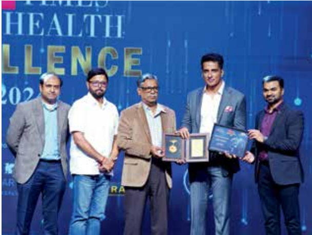
EXCELLENCE IN ROBOTICS SURGERY VASAVI HOSPITALS ( A Unit of Sree Vasavi Trust)