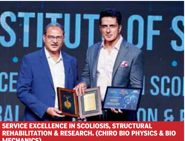
SERVICE EXCELLENCE IN SCOLIOSIS, STRUCTURAL REHABILITATION & RESEARCH. (CHIRO BIO PHYSICS & BIO MECHANICS) ASIAN INSTITUTE OF SCOLIOSIS