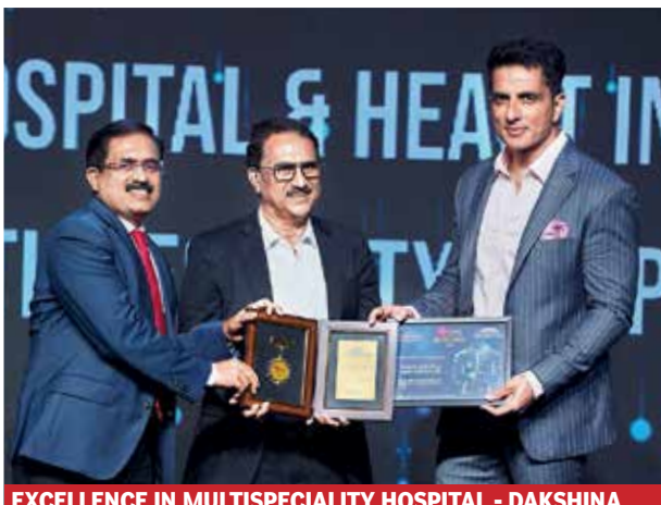
EXCELLENCE IN MULTISPECIALITY HOSPITAL - DAKSHINA KANNADA INDIANA HOSPITAL & HEART INSTITUTE LTD