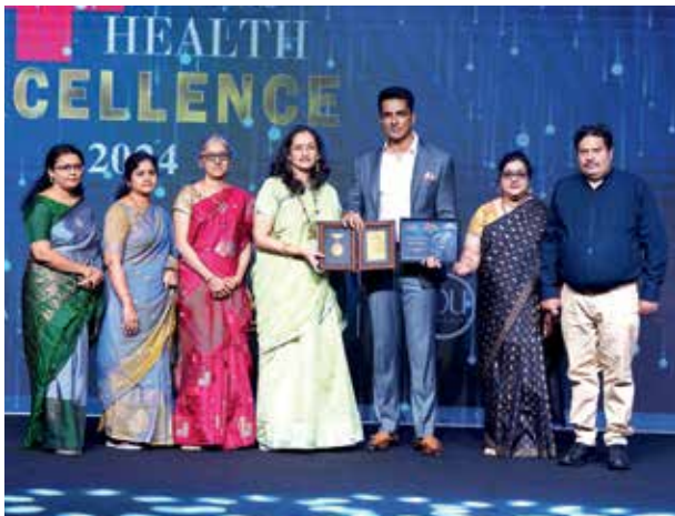
EXCELLENCE IN PANCHAKARMA TREATMENTS ADYANT AYURVEDA