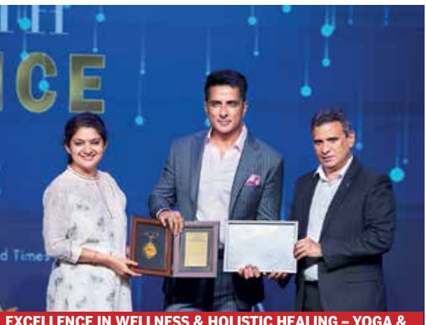
EXCELLENCE IN WELLNESS & HOLISTIC HEALING - YOGA & NATUROPATHY KHEMAVANA