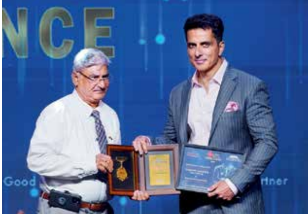
EXCELLENCE IN NUTRACEUTICALS SYNBIOPRO NUTRACEUTIX (OPC) PVT LTD