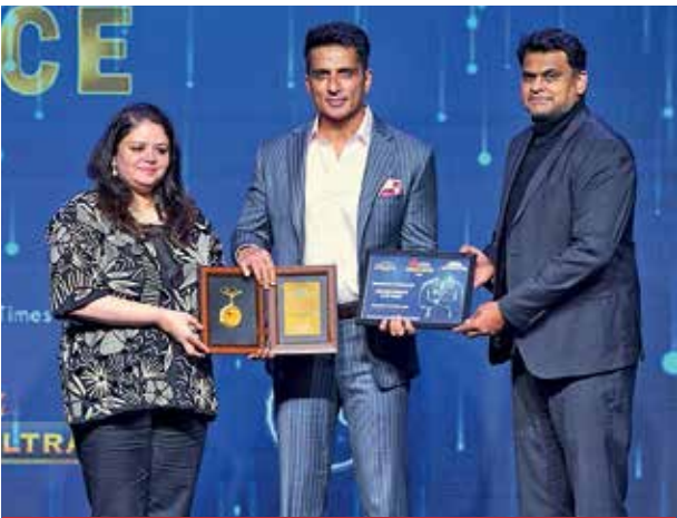
EXCELLENCE IN INFERTILITY CARE ARCHISH FERTILITY & IVF CLINIC