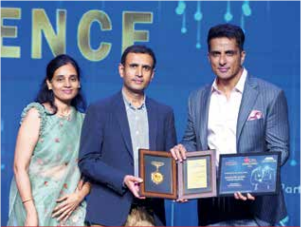
EXCELLENCE IN GASTROENTEROLOGY BANGALORE GASTRO CENTRE HOSPITAL