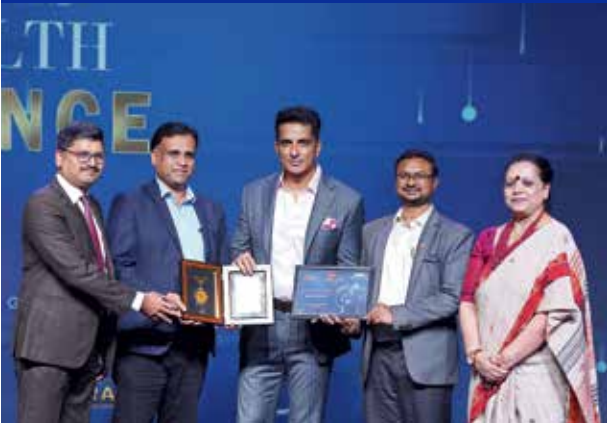
EXCELLENCE IN DEPARTMENT OF NEUROLOGY SAGAR HOSPITALS