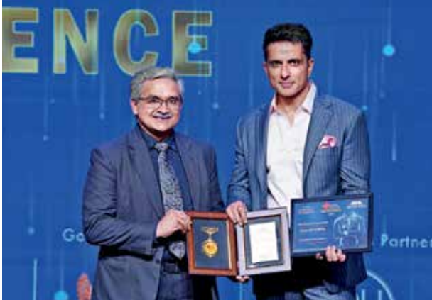
EXCELLENCE IN NEUROSCIENCES ASTER CMI HOSPITAL