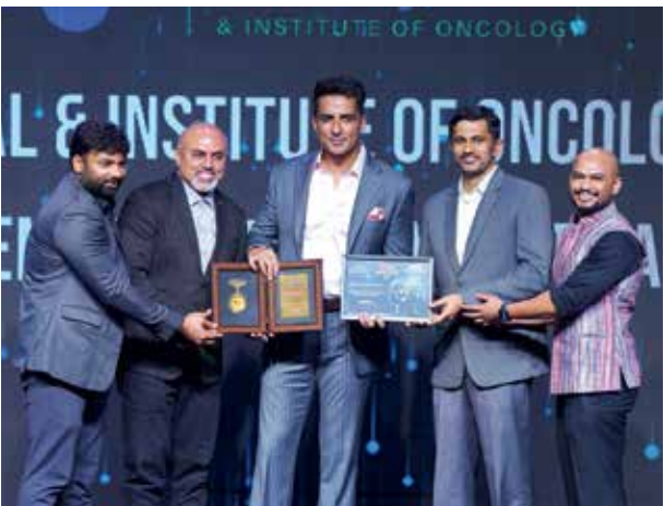
EXCELLENCE IN ONCO PATIENT CARE BHARATH HOSPITAL & INSTITUTE OF ONCOLOGY, MYSURU