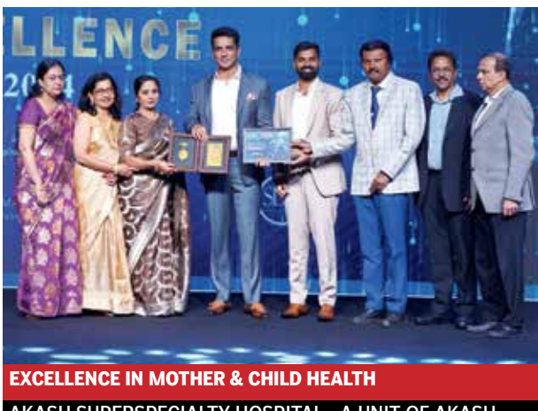
EXCELLENCE IN MOTHER & CHILD HEALTH AKASH SUPERSPECIALTY HOSPITAL - A UNIT OF AKASH INSTITUTE OF MEDICAL SCIENCE AND RESEARCH CENTRE, BENGALURU