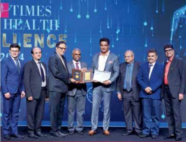
EXCELLENCE IN COMPREHENSIVE MEDICAL CARE P.D. HINDUJA SINDHI HOSPITAL