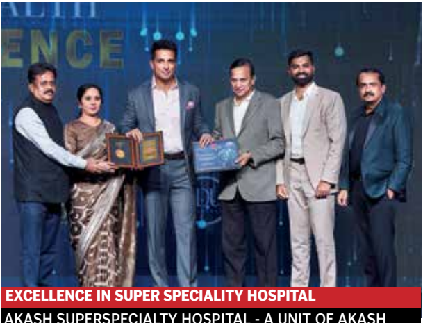
EXCELLENCE IN SUPER SPECIALITY HOSPITAL AKASH SUPERSPECIALTY HOSPITAL - A UNIT OF AKASH INSTITUTE OF MEDICAL SCIENCES AND RESEARCH CENTRE, BENGALURU