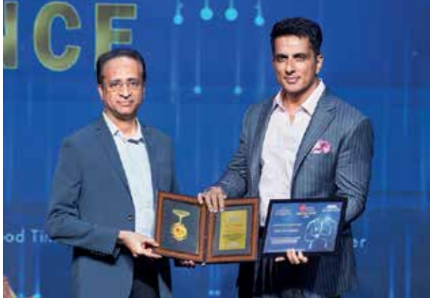
EXCELLENCE IN DEPARTMENT OF HEART FAILURE TREATMENTS AND HEART TRANSPLANTATION PROCEDURES ASTER CMI HOSPITAL